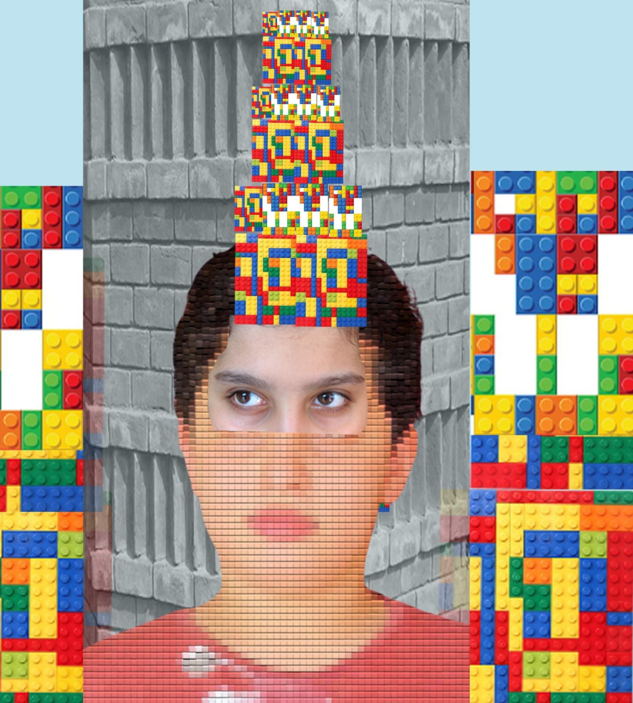
“Play Well” Photo montage