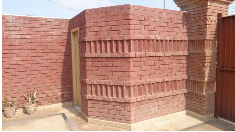
Home brick wall